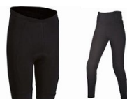
Cyclic shorts/Leggings (of any variety)