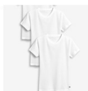
Navy striped loose shorts/ White t-shirt (Indoor Use)